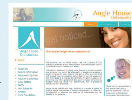
Homepage of our website

For more information about our services log onto our website: www.anglehouseorthodontics.co.uk