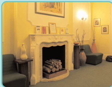
Waiting Room - Enfield

Well it's been over one year since to start of the new contract and we hope you have settled into it. Over this period we have continued to develop our practice and would like to thank you for your continued support in referring your patients to us.