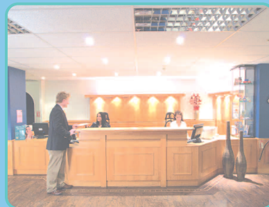
Practice Reception - Edgware

All patients referred to us under the age of 18 years are still entitled to an orthodontic assessment on the NHS. We have found that the majority of these patients are likely thereafter to qualify for NHS treatment, based on the Orthodontic Index of Treatment Needs.